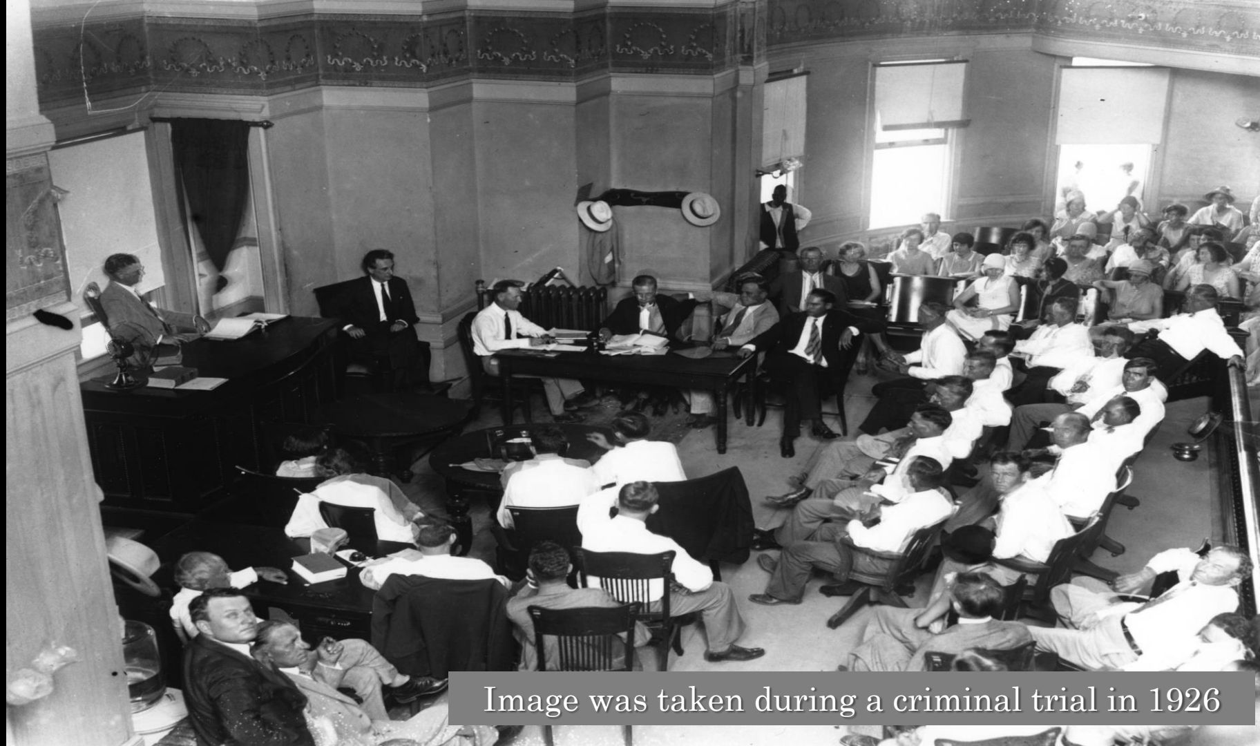
Image was taken during a criminal trial in 1926