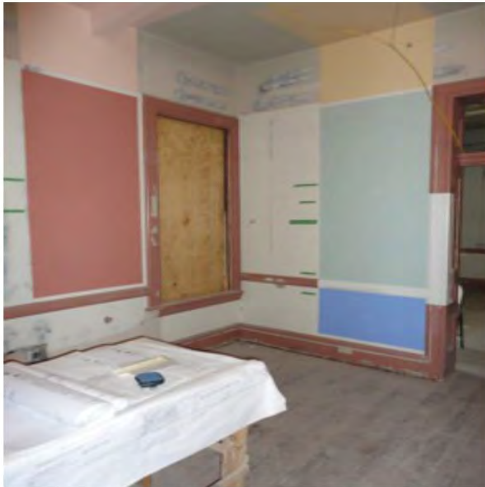
Fig 6: Paint mock up in Room 107. The green-blue "Palladian Blue" is approved for matching to the elevator doors.